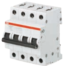
S 203 M NA