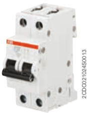
S 202 M