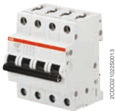
S 204 M