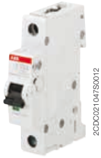
S 201 M