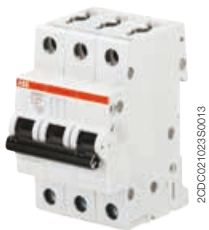
S 203 M